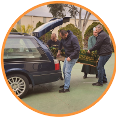
Coordinate the Funeral